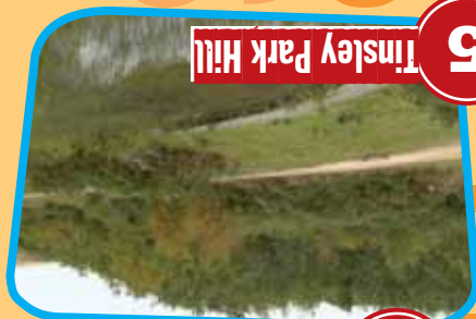
5 Tinsley Park Hill