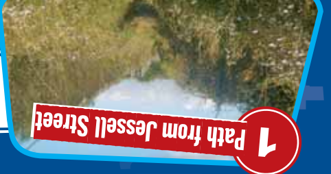
1 Path from Jessell Street

No representations, warranties or undertakings, express or implied are made, and no responsibility or liability will be accepted by the Council or by any of its officers, employees, servants, agents or advisors in relation to the adequacy, accuracy or completeness of this map.