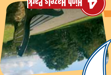
4 High Hazels Park

• Interesting – how many things would you notice on your journey than if you travelled another way