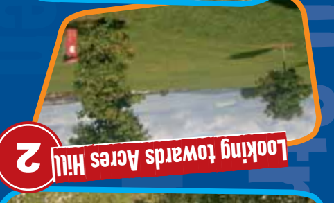
2 Looking towards Acres Hill