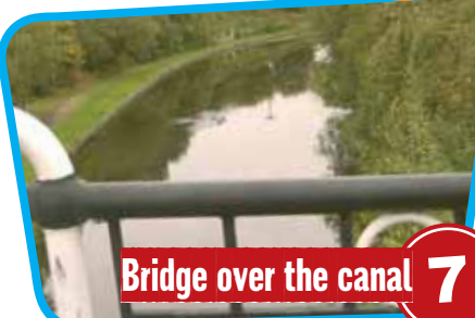
7 Bridge over the canal