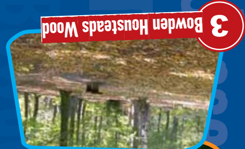
3 Bowden Housteads Wood

Why not plan your walking journey using walkit.com/Sheffield ? Just put in the road or postcode you are going from and to and it will give you the shortest route on a map. It will tell you about the hills you will have to go up and what CO 2 car drivers would save and calories you would burn.