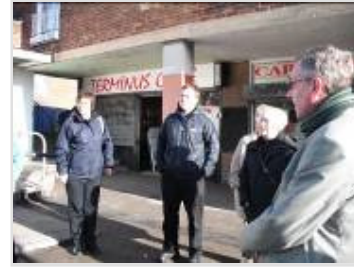
Terminus Shopping Parade