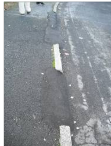
Kerbs on Boland Road