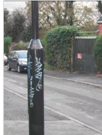
Graffiti on Boland Road