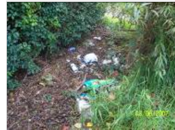
Litter beside path