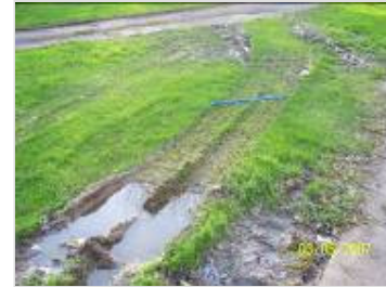
Tyre tracks across verge by Boland Road