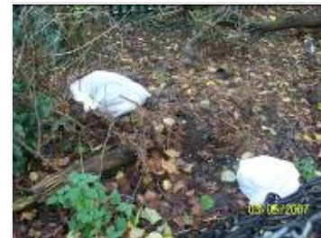
More flytipping by golf course