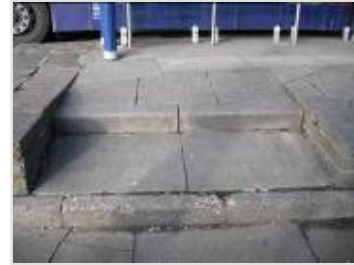
Lowedges bus stop