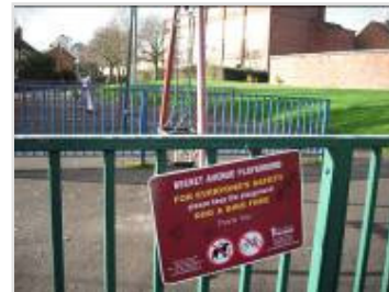
Beckett Avenue Playground